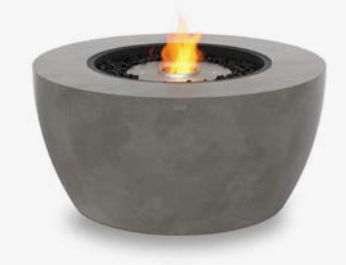
Natural (Pod 40)