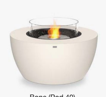
Bone (Pod 40) (featuring optional Glass Fire Screen)